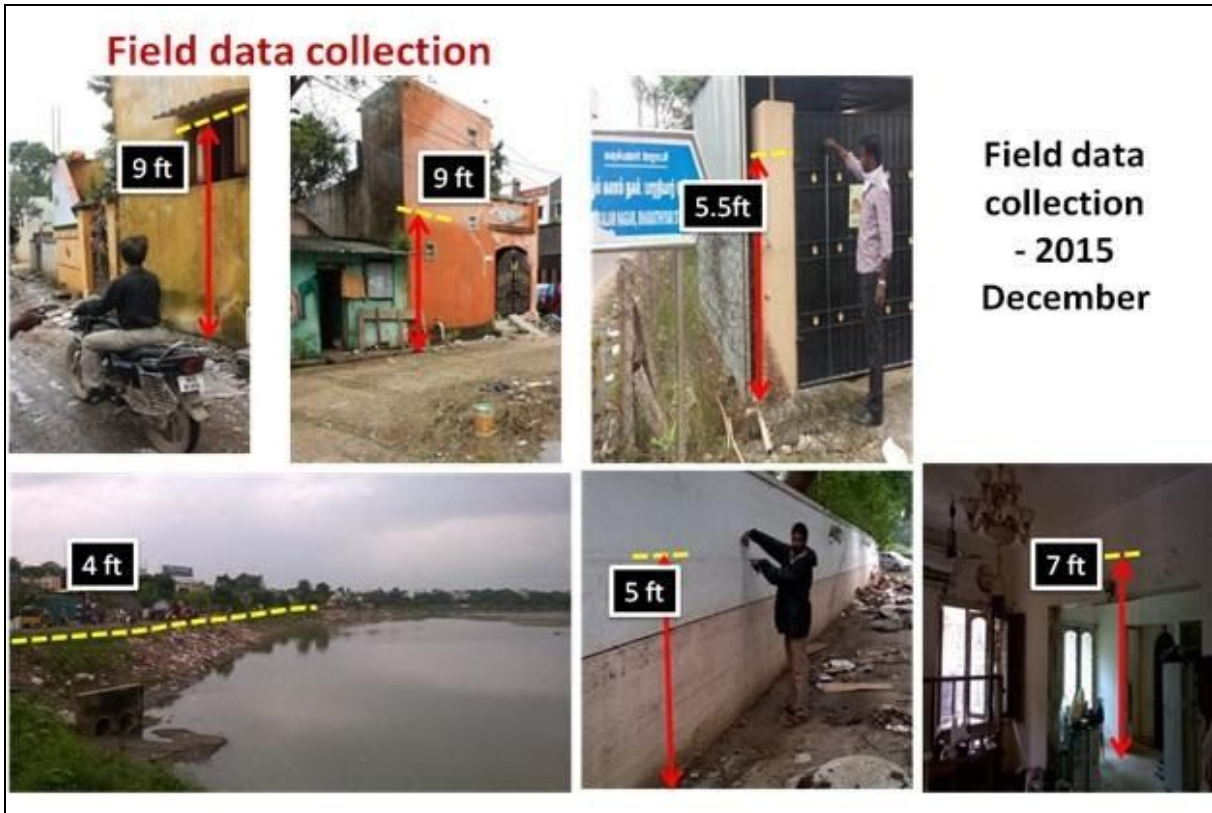
Fig 2. Field data collection