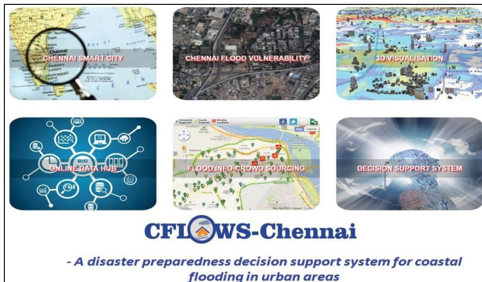
Fig 3. CFWLWS-Chennai Dashboard

The Coastal Flood Warning system for Chennai, referred to as CFWLWS-Chennai, is developed as a Web GIS based decision support system, integrating data and outputs, derived from Weather forecast models, Hydrologic models, Hydraulic models and Hydrodynamic models. The regional weather forecasting models from NCMRWF and IMD, form part of the operational CFWLWS-Chennai. The model datasets were validated, using field data, provided by IMD and the Tamil Nadu state government. Hydrologic models are used to transform rainfall into runoff and provide inflow inputs into the river systems namely Adyar, Coovum and Kosathalayar. Hydraulic models solve equations of fluid motion to replicate the movement of water to assess flooding in the study area. The hydro dynamic models are used to calculate the tide and storm surge impacts into the model domain. Based on these models a flood library, comprising of about 796 Flood inundation scenarios, were developed corresponding to different rainfall return periods, tidal conditions, water discharge conditions etc. The WebGIS based decision support system comprising of six modules was build in-house by NCCR and they are Chennai smart city, Chennai flood Vulnerability, Online data hub, 3D Visualization, Flood info - crowd sourcing and Decision support system (DSS).