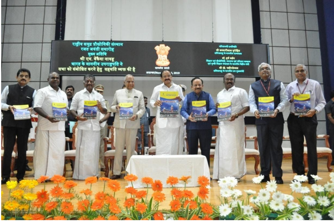
Fig 5. Honorable Shri M. Venkaiah Naidu, Vice President of India released a Red Atlas Action Plan Map