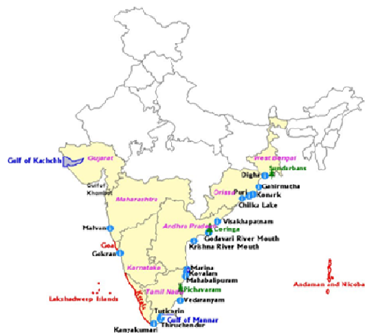
Fig.1. Map showing the ecologically sensitive and other areas need to be protected from oil spills

The present section identifies locations of ecologically sensitive areas, beaches of commercial and recreational importance, historical and pilgrimage sites along the coastline of the country for protecting them against oil spills. Names and locations of these areas are indicated in Fig 1. The degree of sensitivity of these areas in terms of oil spill risks and development of a model to understand the movement of oil during oil spills and their likely impact on flora and fauna have also been described.